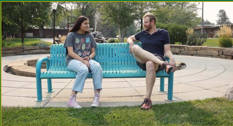
Visiting with YBGR's Youth Pastor and Bible study out in front of the Robbie Chapel.